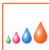
Piezo Variable Drop